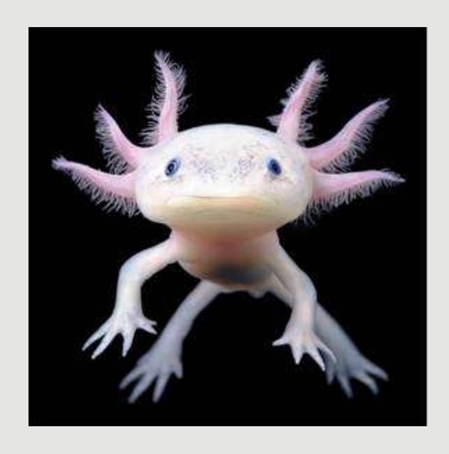
I love this one!

The axolotl in the picture with me is called Axolotl Rose.